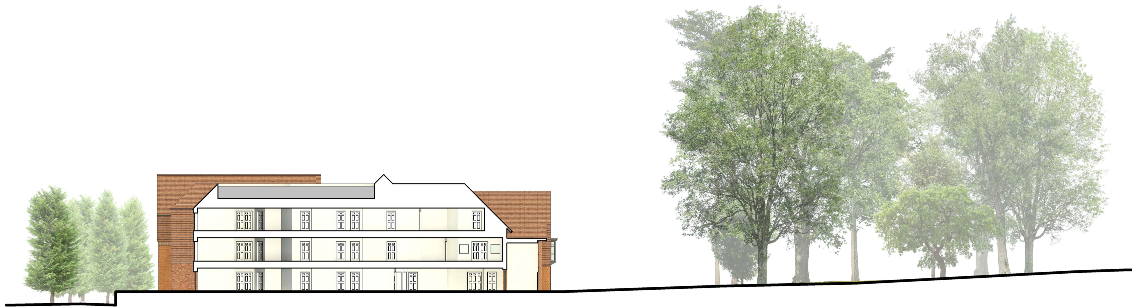
1 Site Section (looking North) 1 : 200

NOTES All dimensions are in millimetres unless stated otherwise. Drawings are not to be scaled for construction purposes. This drawing is to be read in conjunction with all other relevant drawings and specifications. The copyright of this drawing is vested in Harris Irwin Architects Ltd. and must not be copied or reproduced without the written consent of a Director.