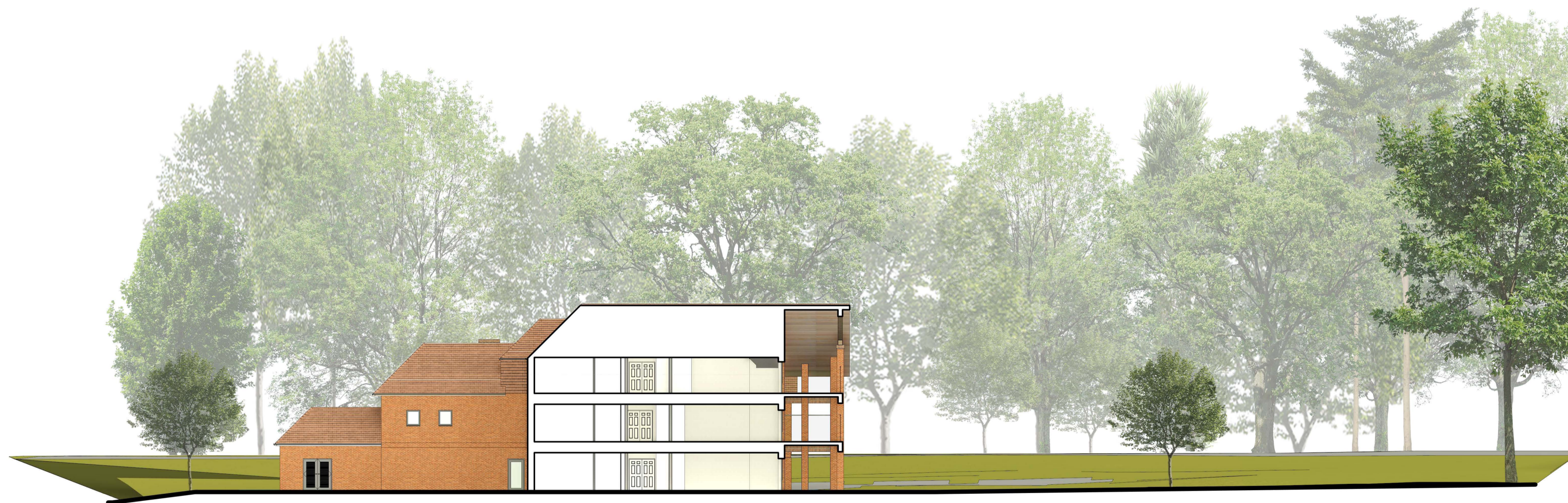
2 Site Section (looking East) 1 : 200